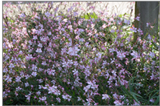
Stratosphere Pink Picotee Gaura in bloom