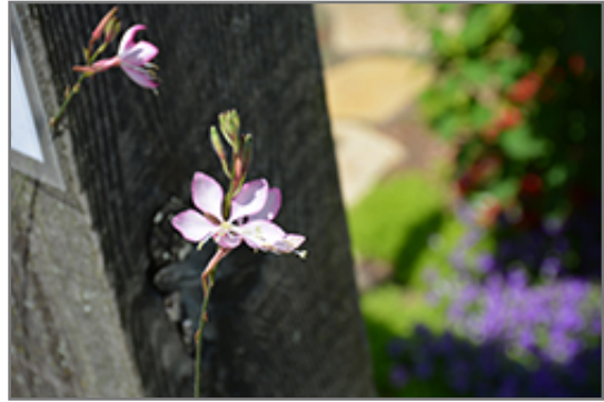
Stratosphere Pink Picotee Gaura flowers

Stratosphere Pink Picotee Gaura is recommended for the following landscape applications;