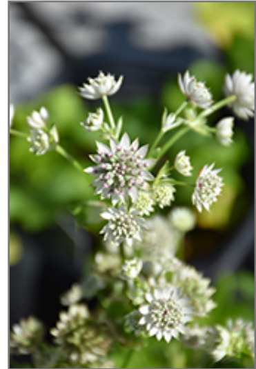
Star Of Billion Masterwort flowers