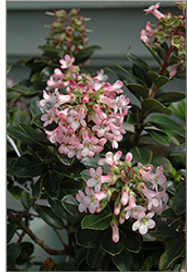
Pink Princess Escallonia flowers

Pink Princess Escallonia is recommended for the following landscape applications;