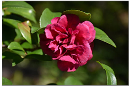
Bonanza Camellia flowers