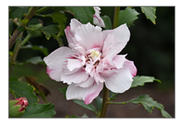
Lady Stanley Rose of Sharon flowers

Lady Stanley Rose of Sharon is recommended for the following landscape applications;