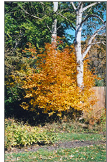
Saskatoon in fall