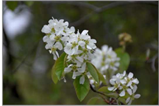
Saskatoon flowers

Saskatoon is a multi-stemmed deciduous shrub with an upright spreading habit of growth. Its relatively fine texture sets it apart from other landscape plants with less refined foliage.