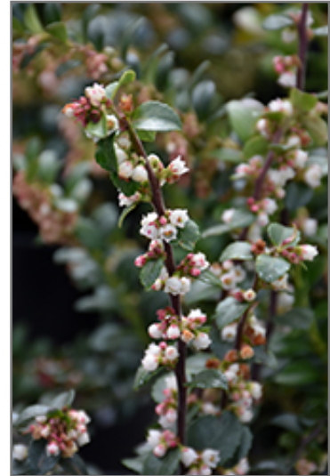
Thunderbird Evergreen Huckleberry flowers