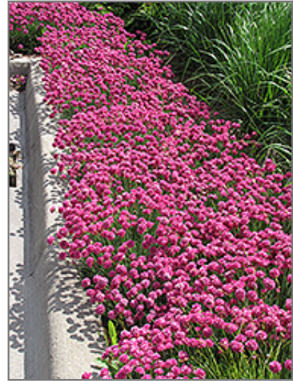
Dusseldorf Pride Sea Thrift in bloom

Dusseldorf Pride Sea Thrift is recommended for the following landscape applications;