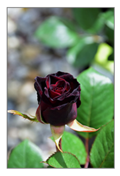
Black Baccara Rose flower buds

4838 Byrne Road Burnaby, BC V5J 3H9 phone: (604) 454-9744 www.swgardens.ca