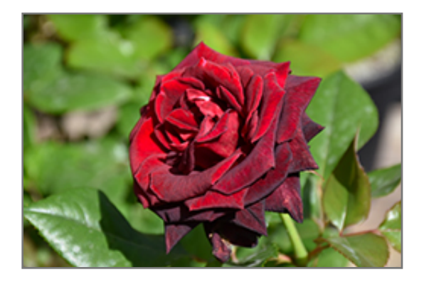
Black Baccara Rose flowers

Black Baccara Rose is recommended for the following landscape applications;