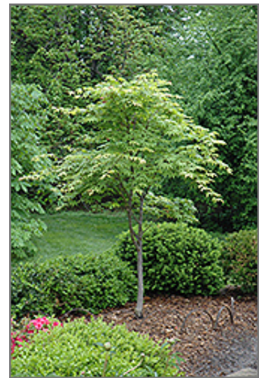
Osakazuki Japanese Maple