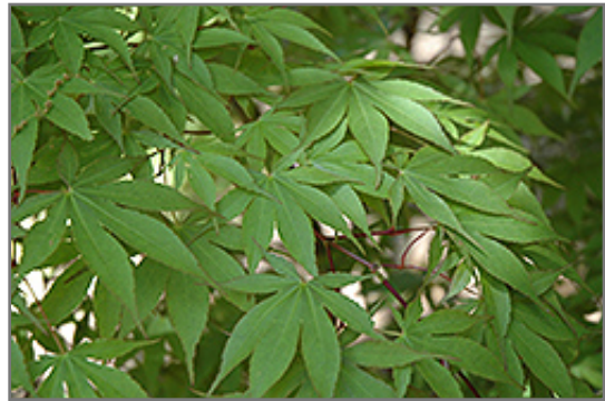
Osakazuki Japanese Maple foliage

This is a relatively low maintenance tree, and should only be pruned in summer after the leaves have fully developed, as it may 'bleed' sap if pruned in late winter or early spring. It has no significant negative characteristics.