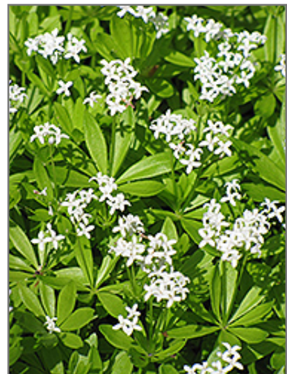
Sweet Woodruff flowers