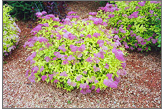
Goldmound Spirea in bloom

This shrub should only be grown in full sunlight. It prefers to grow in average to moist conditions, and shouldn't be allowed to dry out. It is not particular as to soil type or pH. It is highly tolerant of urban pollution and will even thrive in inner city environments. This is a selected variety of a species not originally from North America.