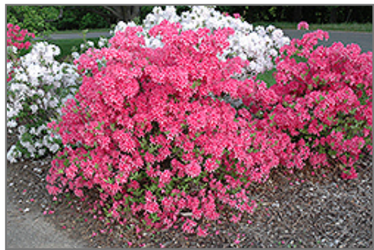
Rosy Lights Azalea in bloom