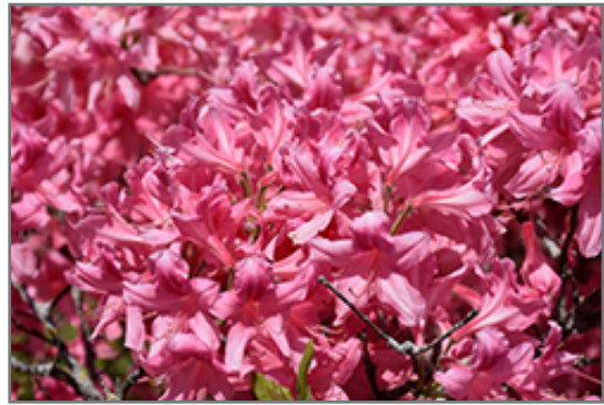
Rosy Lights Azalea flowers

Rosy Lights Azalea is recommended for the following landscape applications;