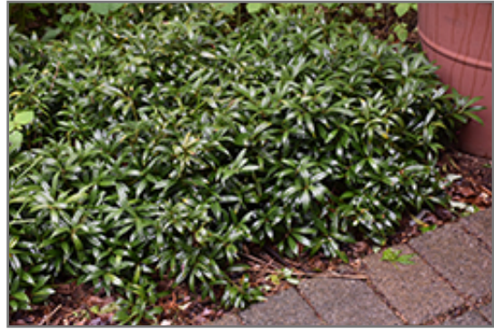
Himalayan Sweet Box

Himalayan Sweet Box is recommended for the following landscape applications;