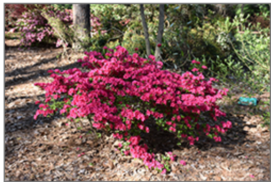
Girard's Fuchsia Evergreen Azalea in bloom