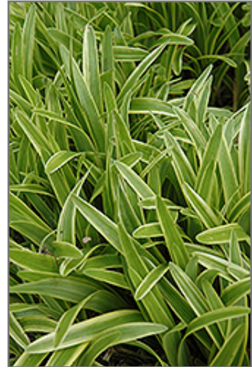
Variegata Lily Turf foliage

This plant does best in partial shade to shade. It does best in average to evenly moist conditions, but will not tolerate standing water. It is not particular as to soil type or pH. It is somewhat tolerant of urban pollution. This is a selected variety of a species not originally from North America. It can be propagated by division; however, as a cultivated variety, be aware that it may be subject to certain restrictions or prohibitions on propagation.