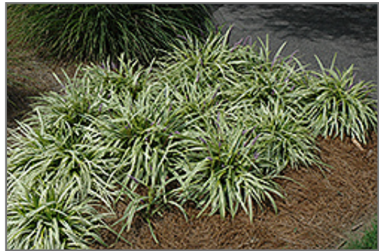
Variegata Lily Turf in bloom