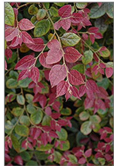
Razzleberri Fringeflower foliage