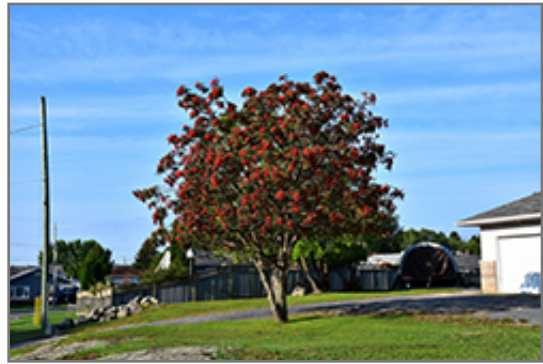
Showy Mountain Ash fruit