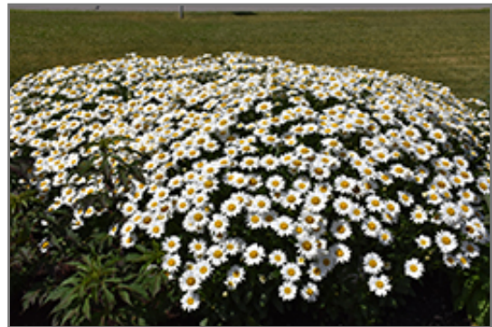
Becky Shasta Daisy in bloom