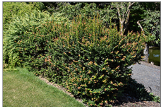
Thunderbird Evergreen Huckleberry