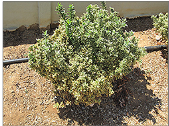
Variegated Boxleaf Japanese Euonymus